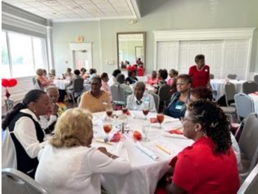
Multiple Tables and Members