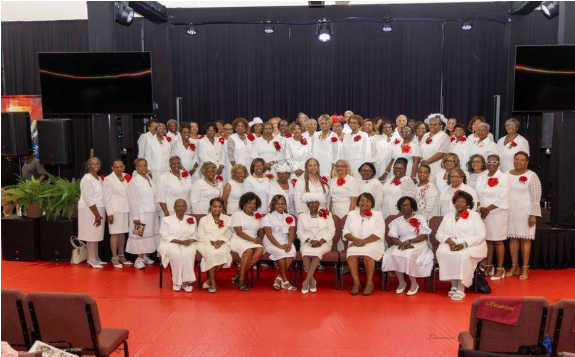
General Missionary Society Annual Day 6/24/24