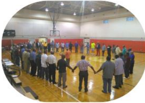
Monthly Fellowship & Prayer