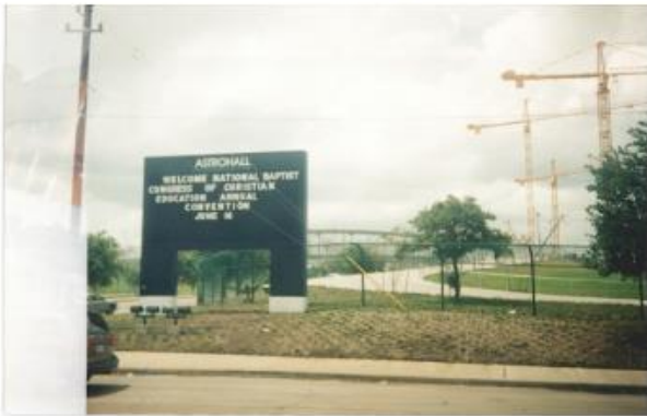
Youth Mission & Youth Advisors attending National Congress of Christian Education in Dallas, Texas