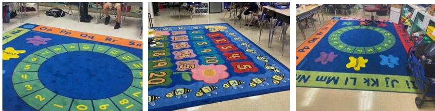
Donation of Educational Floor Rug to Rolling Hills Elementary School (2023)