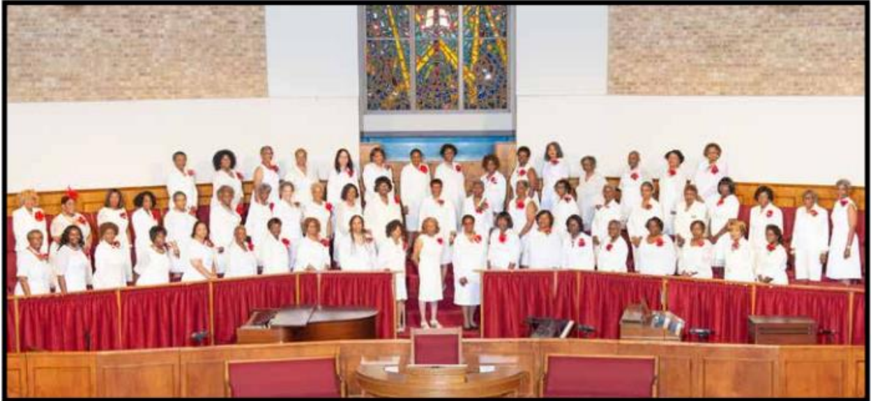
General Missionary Society FMBC's 2022 Pictorial Directory