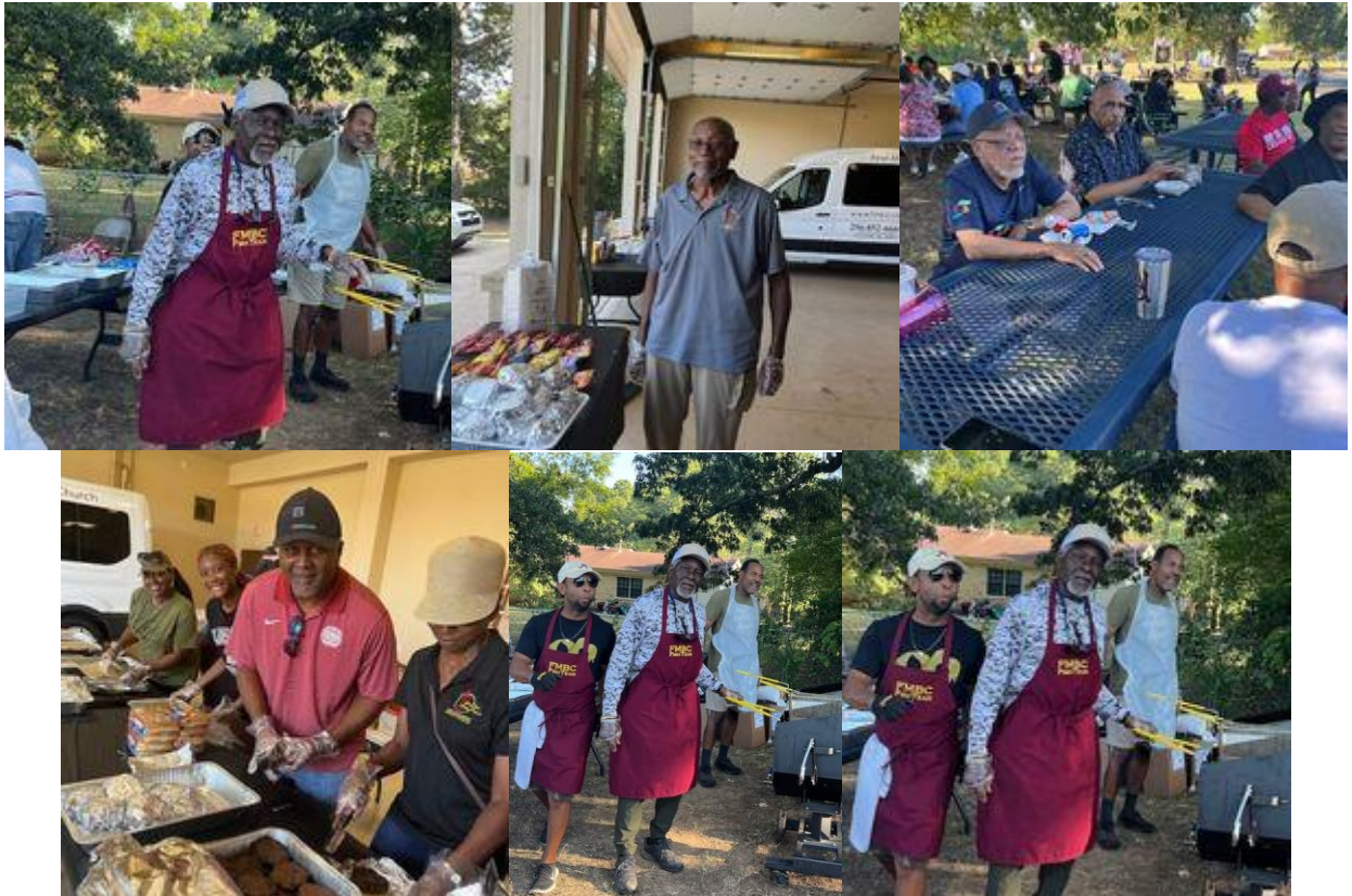
8/24/24 FMBC's Annual Picnic Brotherhood Oranzigation Leading in the Cooking