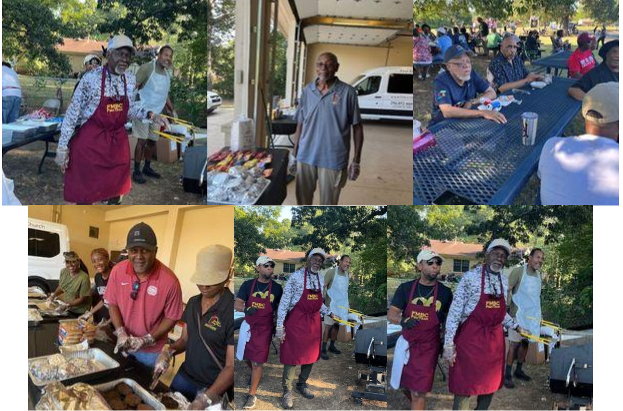
8/24/2024 FMBC's Annual Picnic