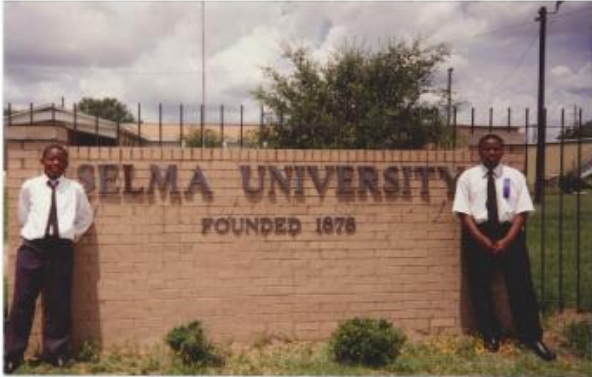
Youth Mission attending State Convention in Selma, Alabama